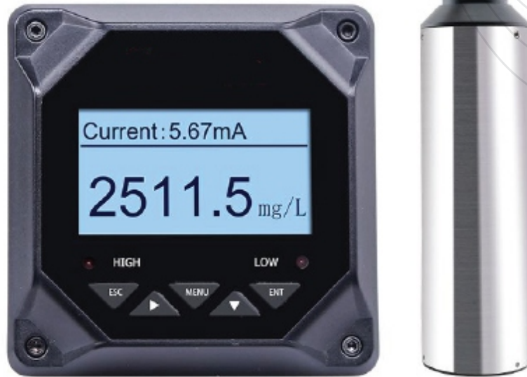
Suspended solids meter PSS100